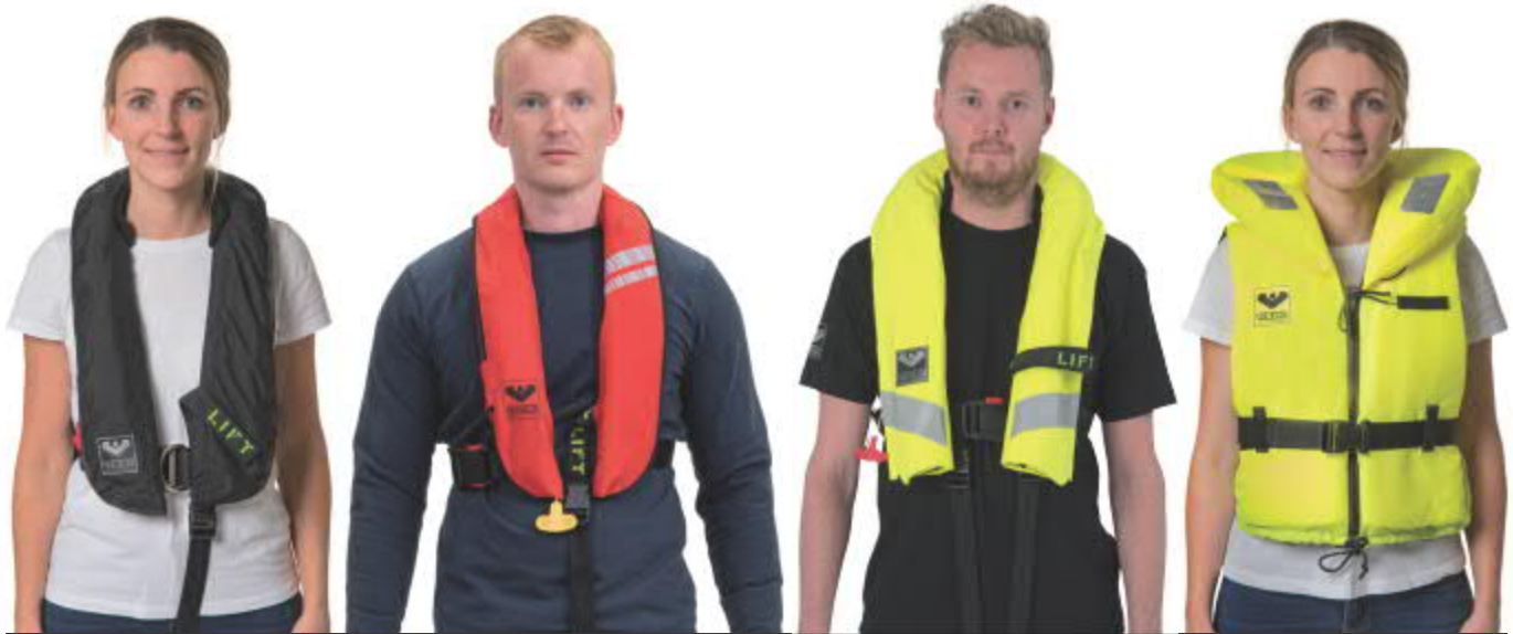
VIKING RescYou™ Conquest

Your safety is our bottom line. All lifejackets inflate in a matter of seconds, and are designed with essential safety features such as crotch strap, SOLAS-grade retro reflective tape and a lifting becket.